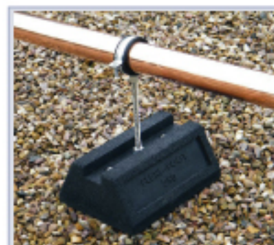
with threaded rod and pipe clamp

The flexi foot universal is a flexible product allowing installers to create their own bespoke solutions on site.