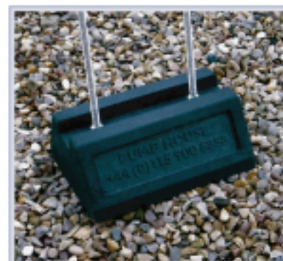
with two threaded rods