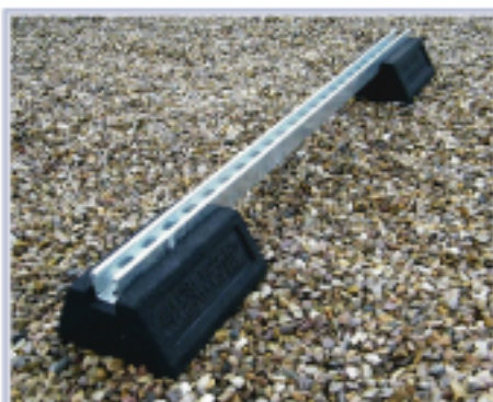
2 x universal foot