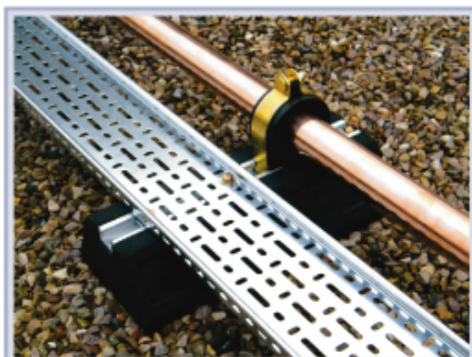
Supporting cable tray and pipework