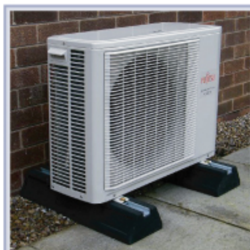
Mounting a condensing unit