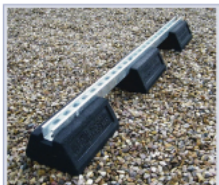
3 x universal foot