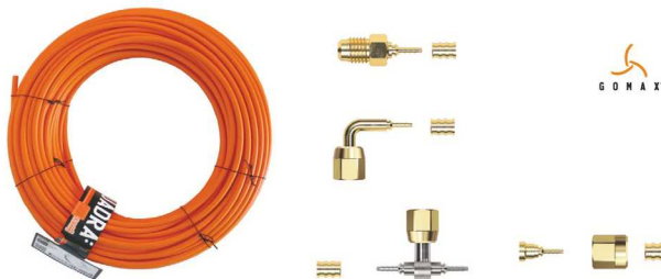
On all Gomax hoses and fittings