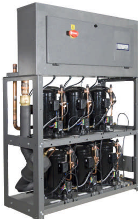
Copeland scroll pack

Specification includes: Powder coated main frame, main suction header inc filter shell assembly, inlet ball valve. Main discharge header with high capacity coalescing separator, pre-charged with oil, Return line manifold with oil filter feeding individual compressor Traxoil regulating modules. Each compressor would be provided with pre-set HP & LP safety switches connected via service ports Control panel, split into mains and low voltage sections, High voltage section is behind the left had panel door and is protected by mains isolator. Low voltage control circuits include the controller fitted to the right hand dood panel. Primary control is via a Carel PCO with secondary/ backup via LP switches. A 32 amp 3ph supply is provided for a remote condenser, along with a 0-10v output to control EC fans.