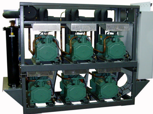
Bitzer semi-hermetic pack